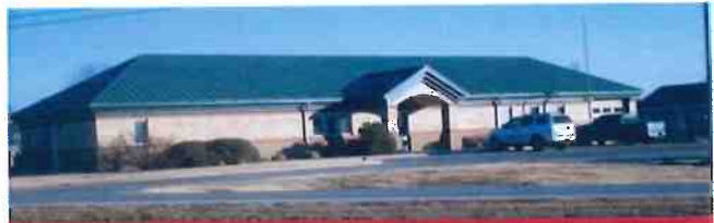
Photo 6.2 Victoria Health and Public Safety Center Source: http://victoriaks.com/health.htm

Source: http://victoriaks.com/health.htm